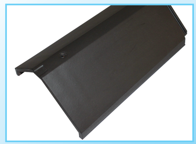
Dura Clay Ridgetile in anthracite.

Dura Clay Ridgetiles are a no fuss roofing product. Simply fix your starter ridge to the ridgeboard and connect each ridgetile in sequence using the fixings provided. The Dura fixing system allows the installer to fix in any type of weather conditions, whilst also providing a thoroughly secure and maintenance free ridge system.