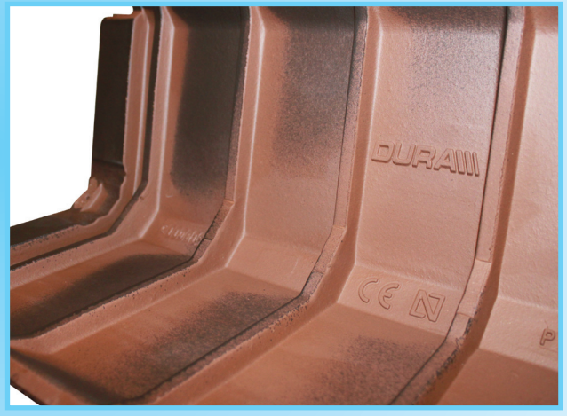
Dura Clay Ridgetiles are a no fuss roofing product.